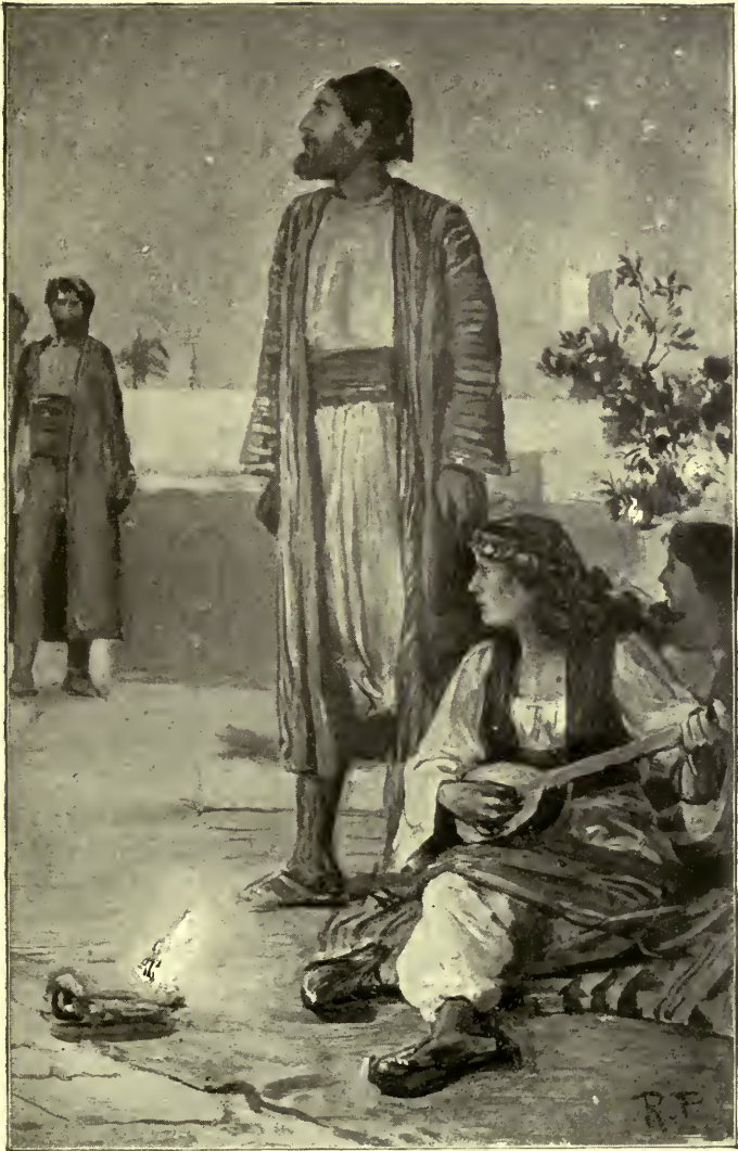
A GIRL WAS PLAYING A LUTE, AND ANOTHER SINGING TO HER ACCOMPANIMENT.